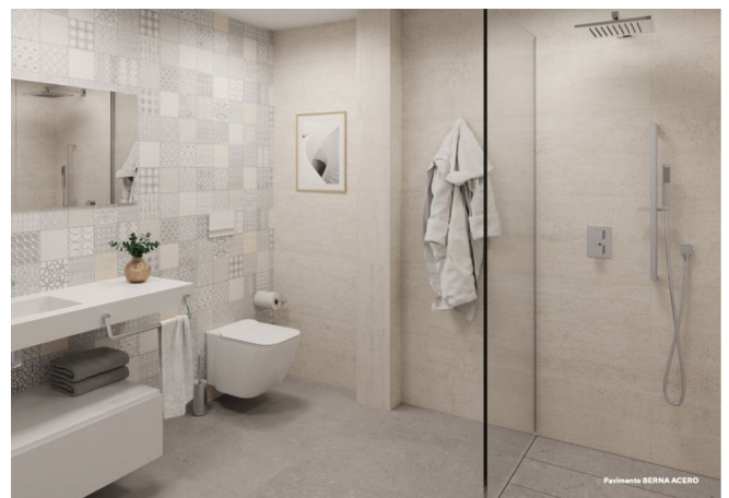
Pavimento BERNA ACERO