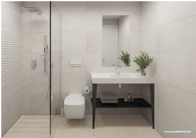
Pavimento BERNA CALIZA